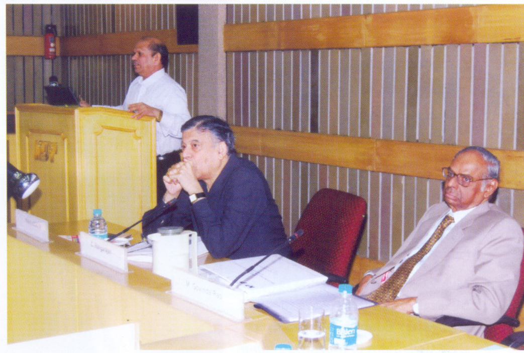
Seminar on Issues Before the Thirteenth Finance Commission

NIPFP organized a seminar that brought together the Chairman and Members of the Thirteenth Finance Commission, senior finance department officials at the state level, academicians, representatives of the Planning Commission and international agencies. Several presentations were made by NIPFP faculty members and other emininent researchers drawn from all over the country. An edited volume of the seminar papers is under preparation.