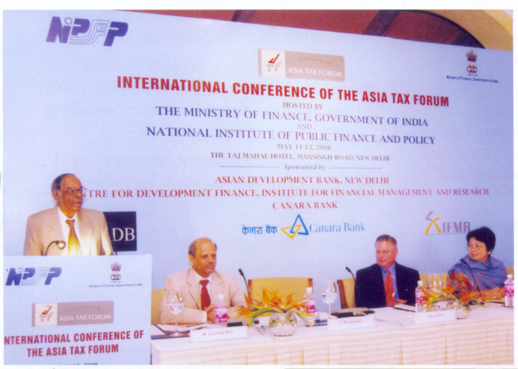
NIPFP & Ministry of Finance hosted the Fifth Asia Tax Forum

11-13, 2008, at Taj Mahal Hotel, New Delhi. The forum focused on VAT, and excise taxation. This year's forum was attended by participants from governments of 12 countries and regions, in addition to experts from 4 countries, besides private sector participants from 4 industries. The areas of discussion included issues in the introduction and implementation of VAT, with dedicated focus on VAT on financial services, benchmarking and use of tax expenditures, use of petroleum excises in environmental tax policy, and use of information