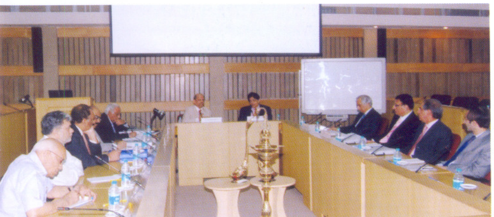
Delegation from the Planning Commission of Pakistan

June 25, 2008: Visit of High-level Delegation from the Planning Commission of Pakistan was led by its Deputy Chairman. The delegation also included High Commissioner of Pakistan to India, and senior members of the administration of Government of Pakistan.