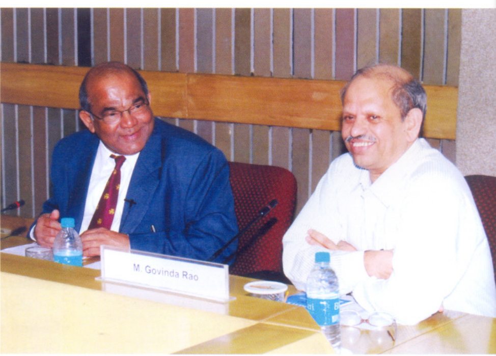
Lecture on Fiscal Policy and Economic Reforms by Y.V. Reddy, Governor, RBI